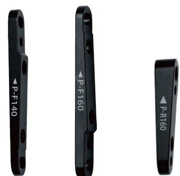
S8 S8 S9