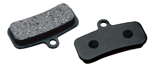
SL-1.0 Brake pads 5mm thickness