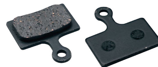
SL-3.0 Brake pads 4mm thickness