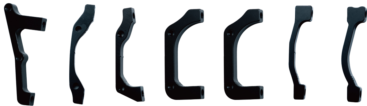
S7 S1 S2 S3 S4 S5 S6

NOTE = F: Standard front fork R: Standard rear frame None: Currently not available