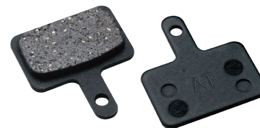
SL-2.2 Brake pads 4mm thickness