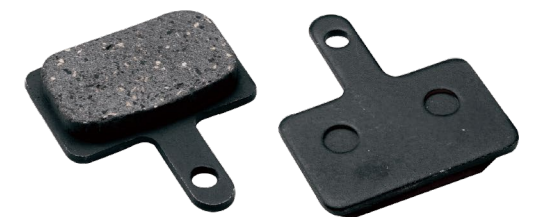
SL-1.1 Brake pads 5mm thickness