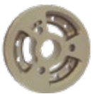
HLSRC DH 2XRC3 VALVE