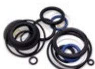
FOX / ROCKSHOX MICRO-BRAIN MAIN SERVICE KIT ND-130-012