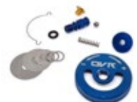
OVR ADJUST KIT ND-300-OVR-102