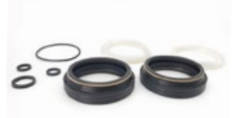
40MM SEALS KIT ND-100-140