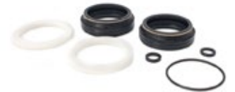
35X44MM SEALS KIT ND-100-135-1