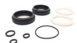
38MM SEALS KIT ND-100-138