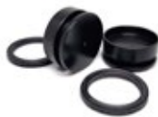
SCOTT DT SWISS EQUALIZER 2 IFP ND-120-013