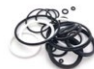
FOX FLOAT X2 MAIN SERVICE KIT ND-130-015