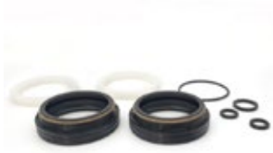
36MM SEALS KIT ND-100-136