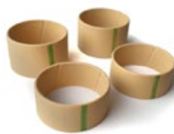
BUSHING KIT ROCKSHOX 32 [2017-CURRENT]