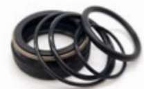
SPECIALIZED COMMAND POST SEAL KIT ND-130-003