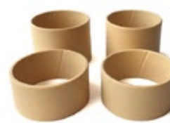
BUSHING KIT ROCKSHOX 35