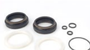
36X45MM SEALS KIT ND-100-136-1