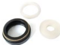
ROCKSHOX REVERB SEAL KIT ND-130-002