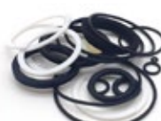
FOX FLOAT MAIN SERVICE KIT ND-130-011