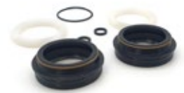
32X42MM FLANGED SEALS KIT ND-100-132-L