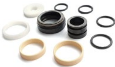
ROCKSHOX REVERB SERVICE KIT ND-130-001