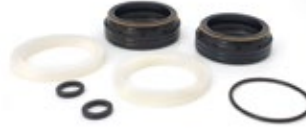
32X42MM SEALS KIT ND-100-132