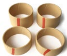
BUSHING KIT ROCKSHOX 32 [2010-2016]