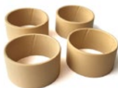
BUSHING KIT FOX 32