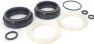
34MM SEALS KIT ND-100-134