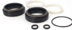
35MM SEALS KIT ND-100-135